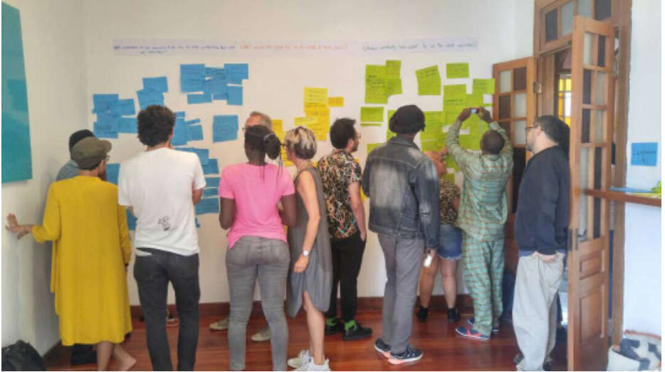
Arts Collaboratory | 2017 Assembly in Costa Rica.