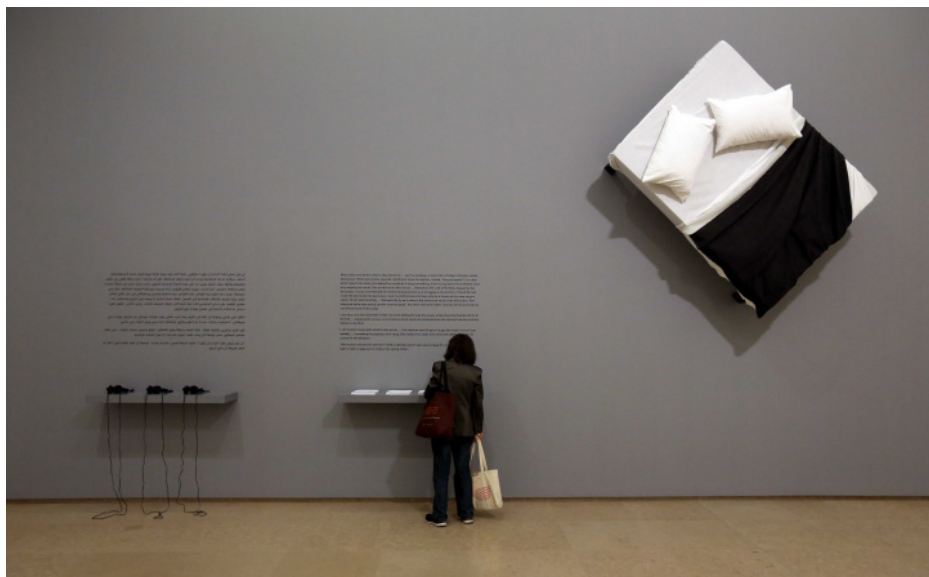
Sharjah Biennial 13 | Fruit of Sleep opening at Sursock Museum.

Hicham Khalidi's exhibition An unpredictable expression of human potential sought to address the current moment of disenfranchisement and frustration, pondering whether the young generation holds the vitality needed to upturn the socio-political legacies of modernity.