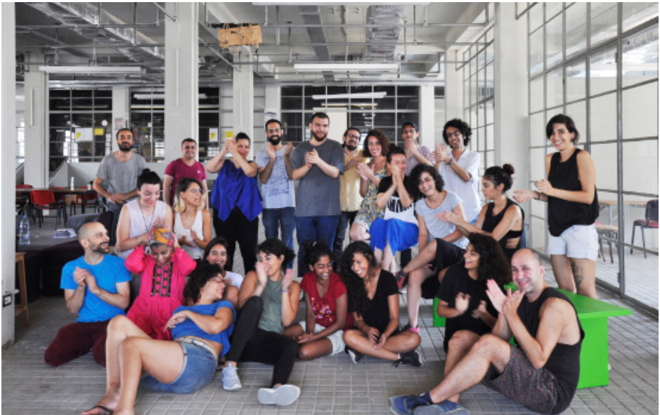
Home Workspace Program 2016-17 | preface , .

As with every year, Open Studios marked the end of HWP, taking place 12-15 July 2017, each fellow presented a new work-in-progress in Ashkal Alwan. The event was highly visited with over 600 visitors throughout the four days.