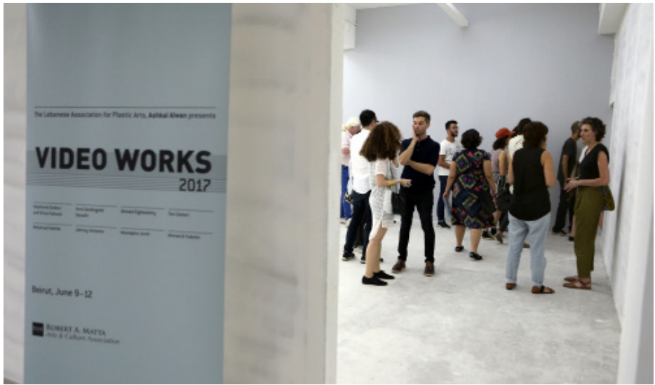
Video Works 2017.