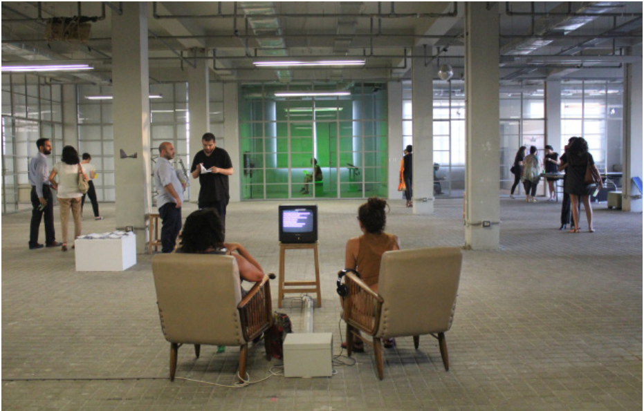
HWP 2016-17 | Open Studios. Courtesy of Ashkal Alwan

In addition, Ashkal Alwan continued to develop its public facilities and the digital archive as well as running its core programs: in June, Home Workspace Program (HWP) concluded the 6th edition with the annual Open Studios, and October welcomed fifteen new fellows for the 7th edition of HWP. Video Works allocated four grants this year, and four additional projects were selected to receive support for the 2017 edition, which took place June 2017.