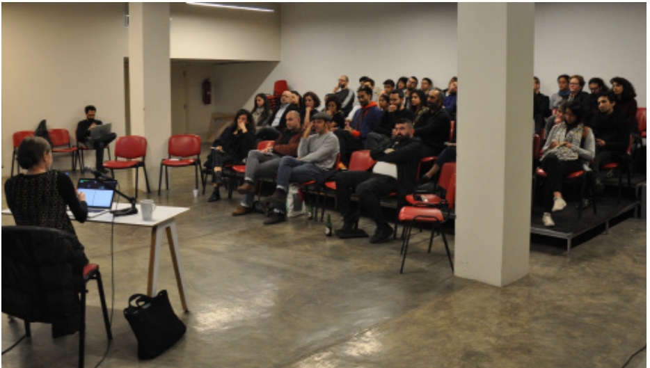
Home Workspace Program 2016-17 | Public talk, Module 3: Technologies, life and the Future with Keller Easterling