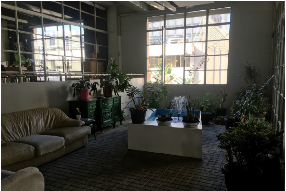
Ashkal Alwan space.