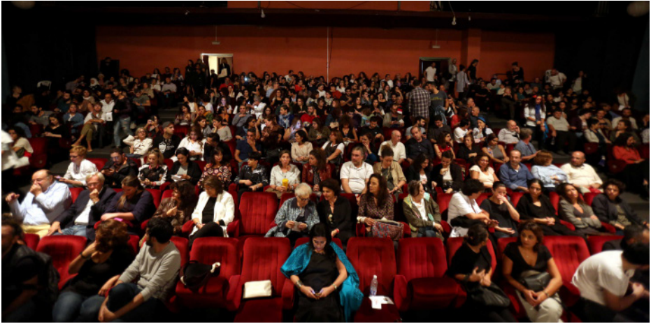
Sharjah Biennial 13 | TAO Dance Theater.