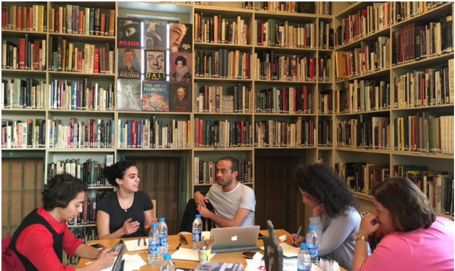
Arts Collaboratory | Middle East 'banga' Meeting in Jordan.

During the assembly, Middle East based organizations: Ashkal Alwan, Al-Ma'mal Foundation (Jerusalem), RIWAQ (Ramallah) and Darb 1718 (Cairo) decided to organise a “banga” meeting in Amman, Jordan to discuss a possible regional collaboration.