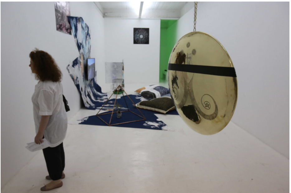
Sharjah Biennial 13 | An unpredictable expression of human potential opening at Beirut Art Center. Photo by Marwan Tahtah