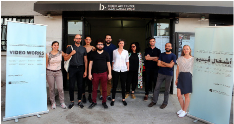
Video Works 2017.